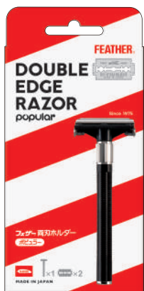
Double Edge Razor "Popular" #FH-H