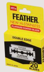
Hi-Stainless Double Edge blade (Hanging Box Type) 10'x2 #81S-2