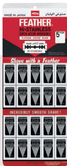
Hi-Stainless Double Edge blade (Hanging Card Type) 5'x20 #61-S